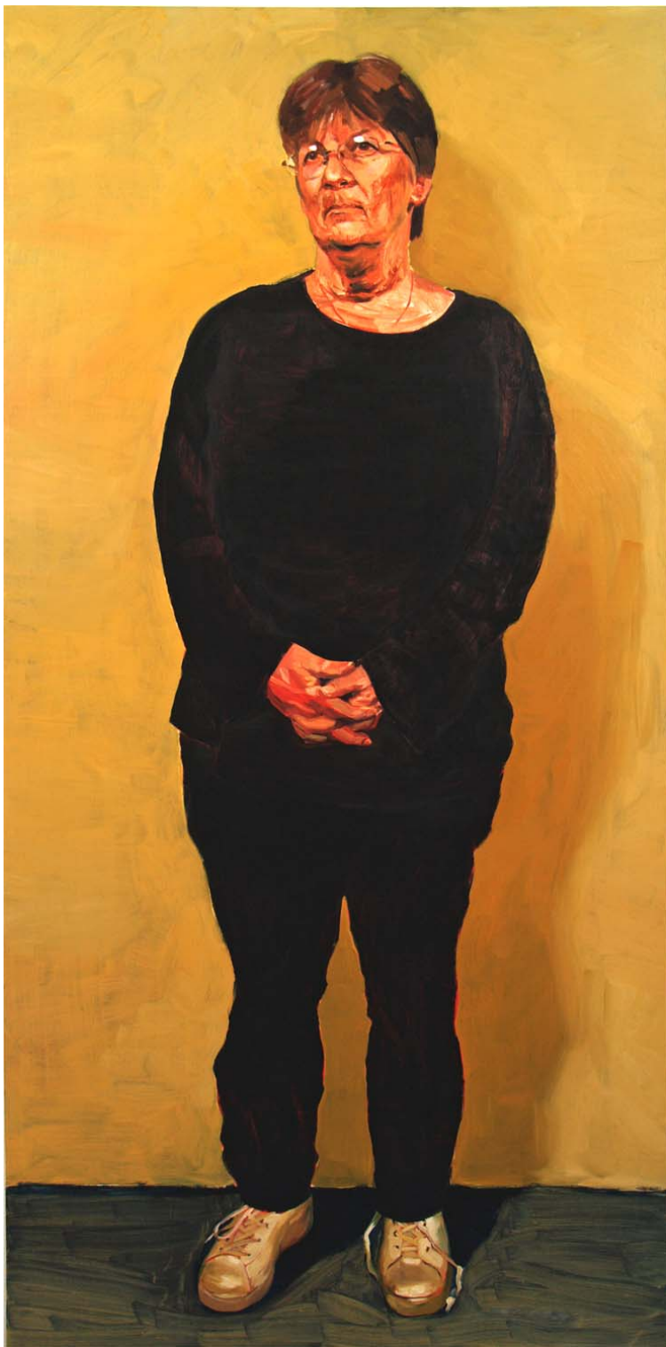
11. Elizabeth oil on panel 60" x 30"