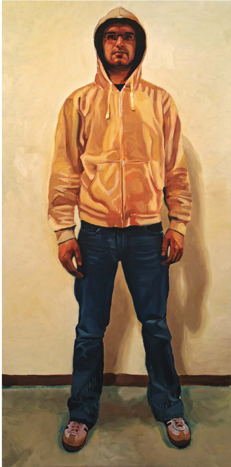
8. Caleb oil on panel 60" x 30"