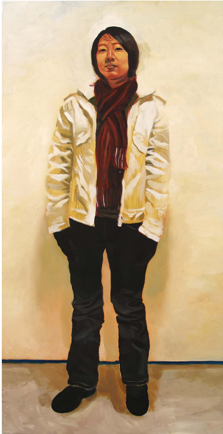
7. Alexa oil on panel 60" x 30"