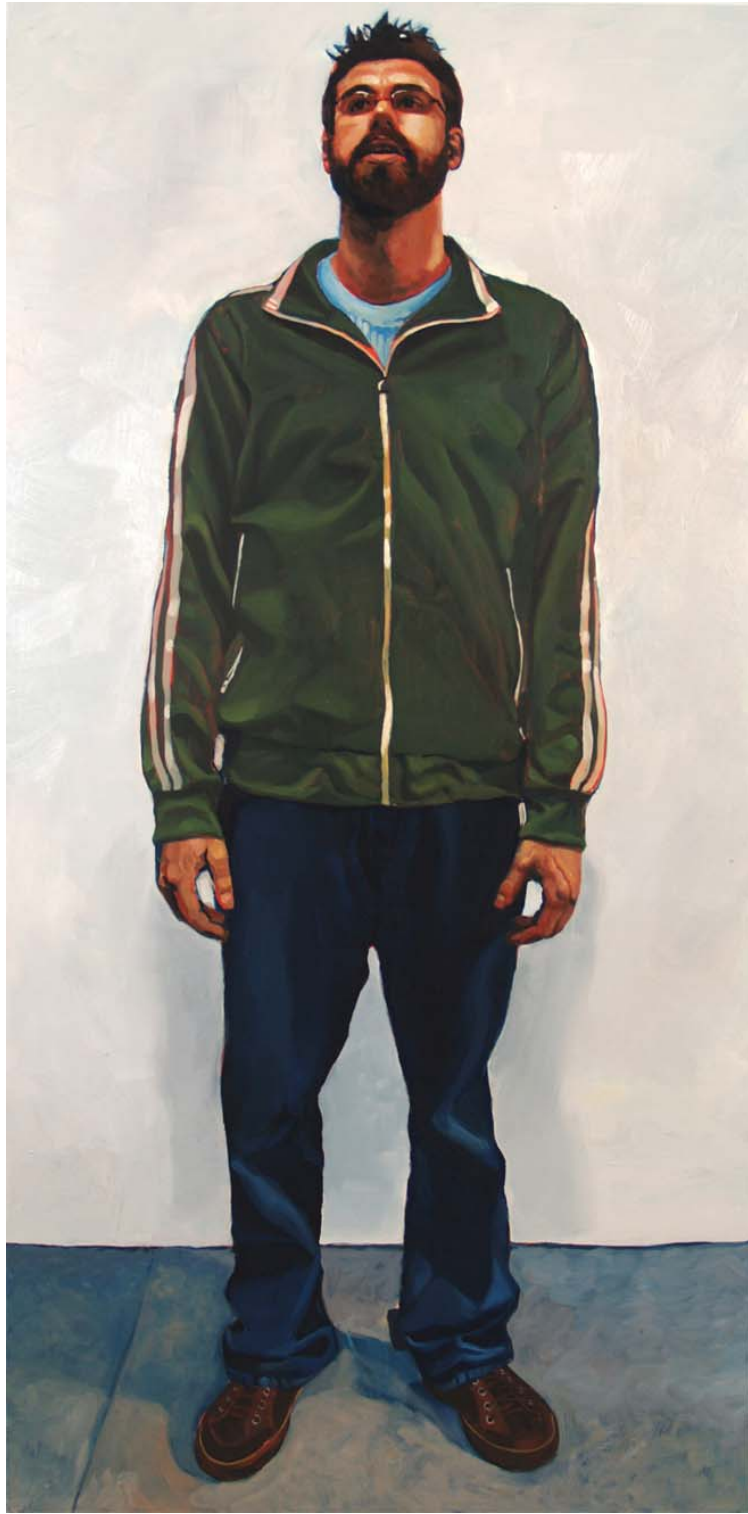
9. Chris oil on panel 60" x 30"