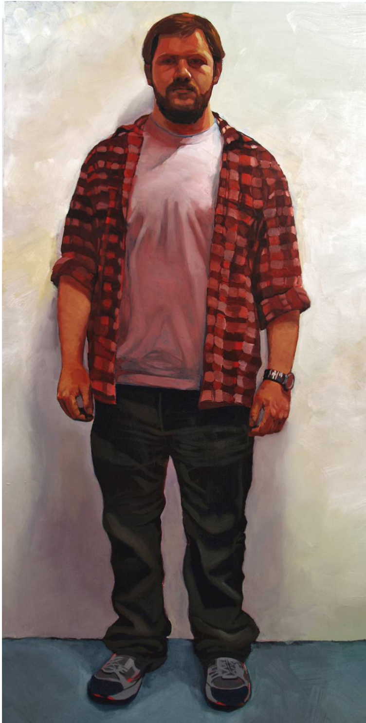
18. Self Portrait oil on panel 60" x 30"