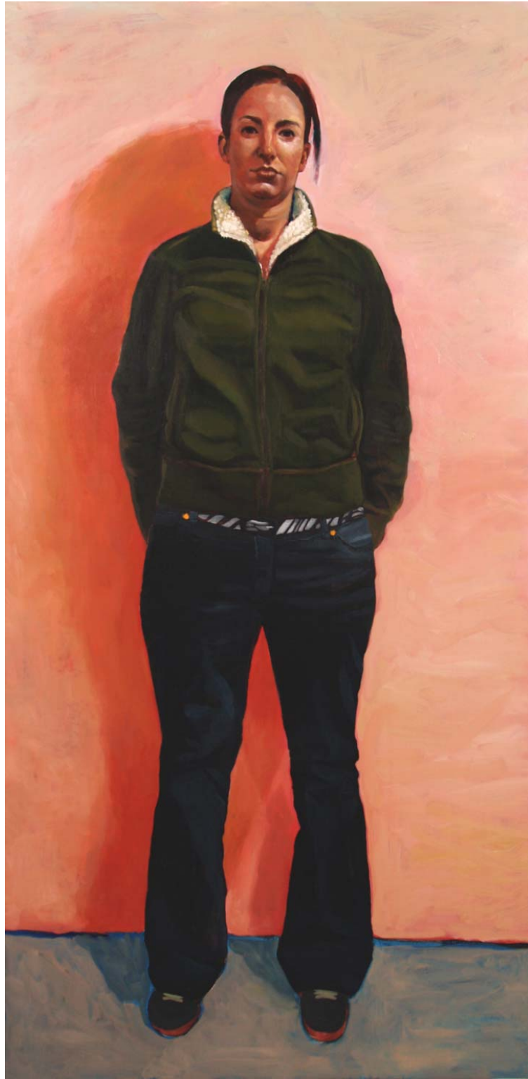
17. Sarah oil on panel 60" x 30"