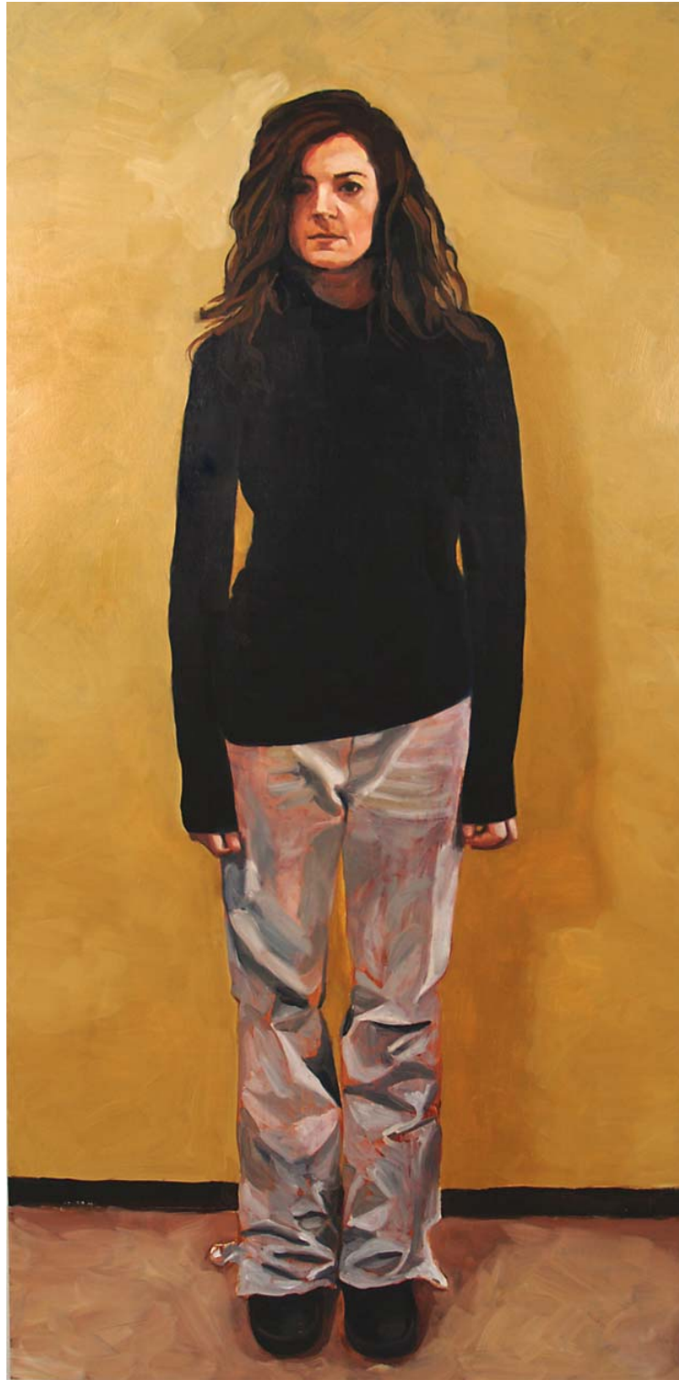
14. Madeline oil on panel 60" x 30"