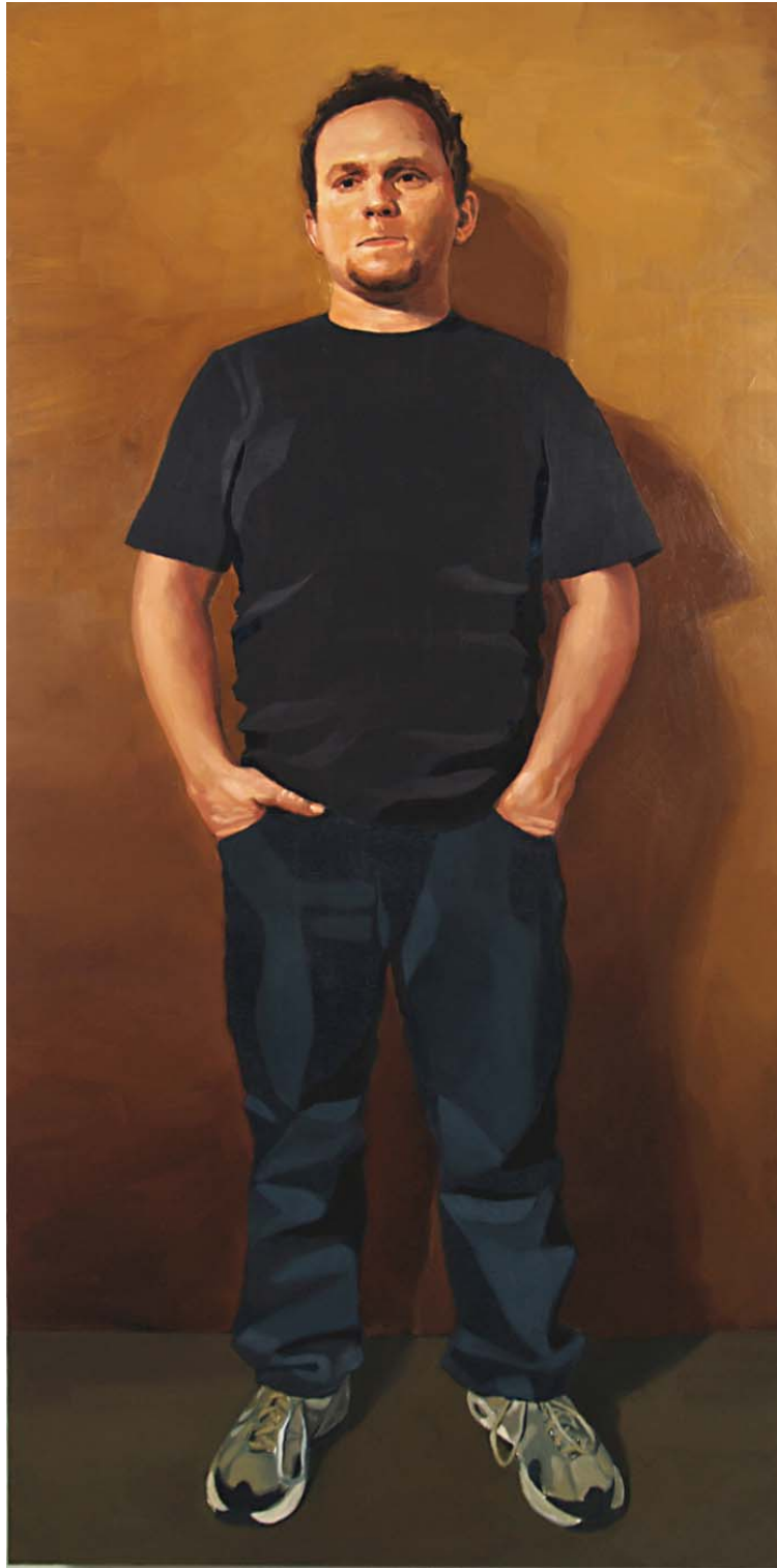
15. Mike oil on panel 60" x 30"