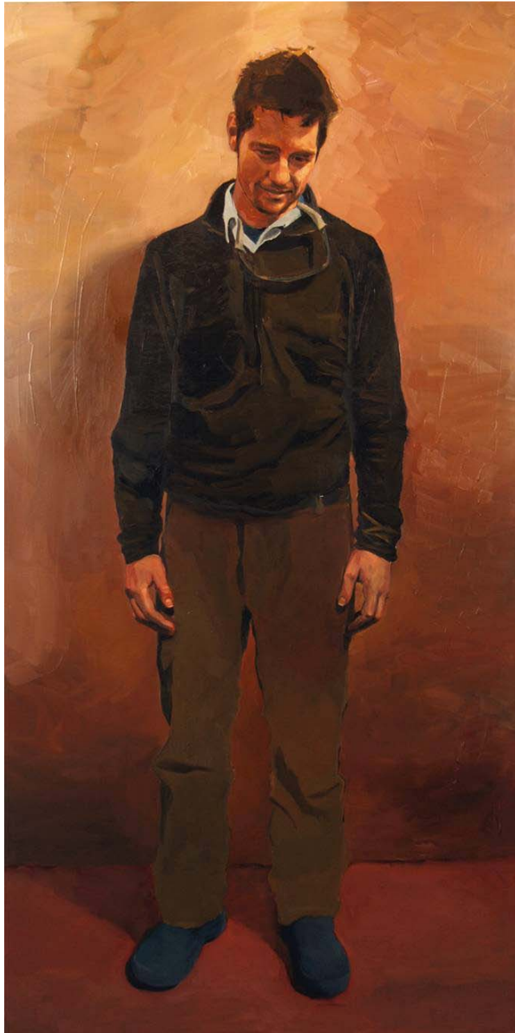
10. Drew oil on panel 60" x 30"