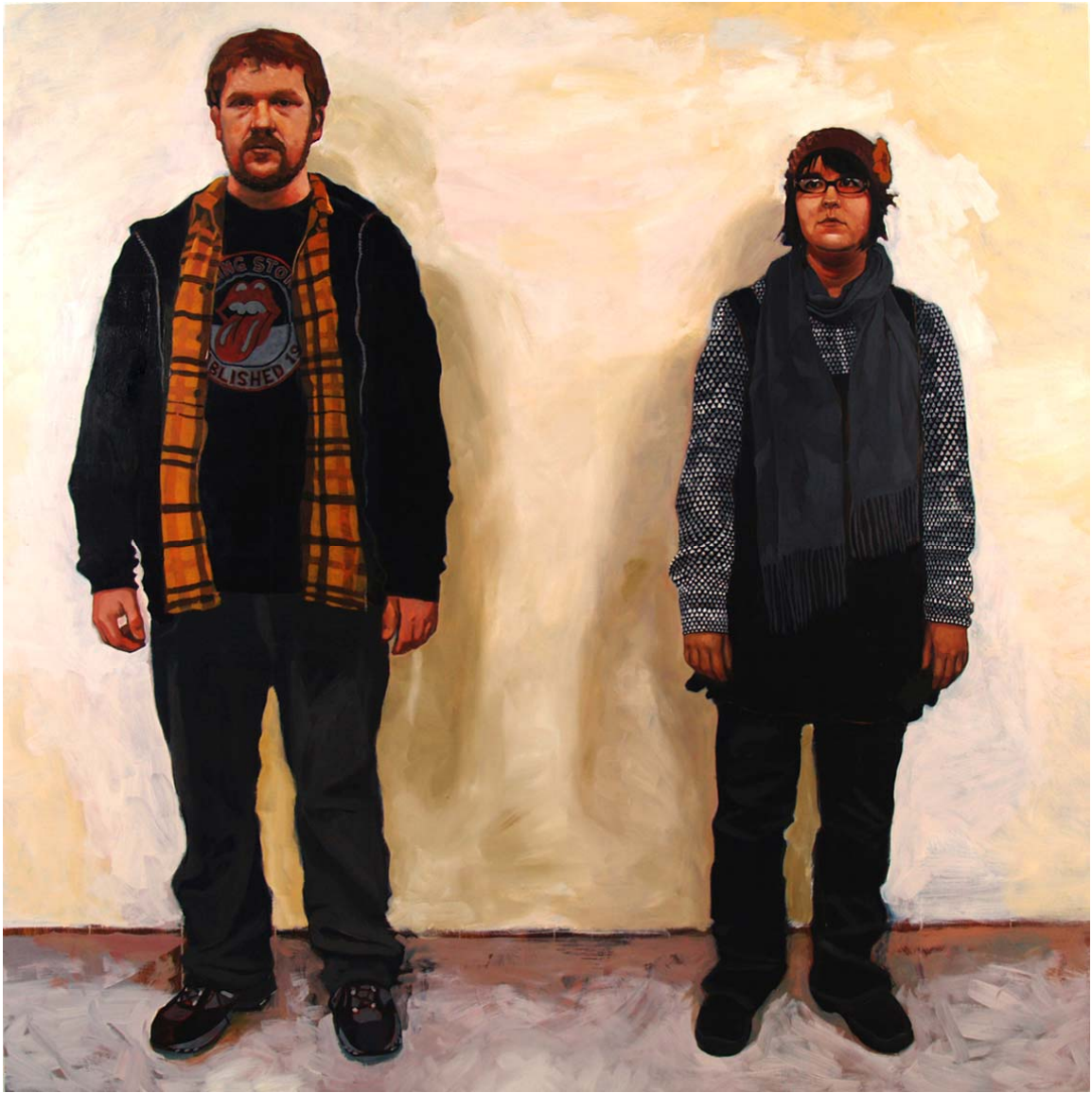
16. Paul and Linda oil on panel 60" x 60"