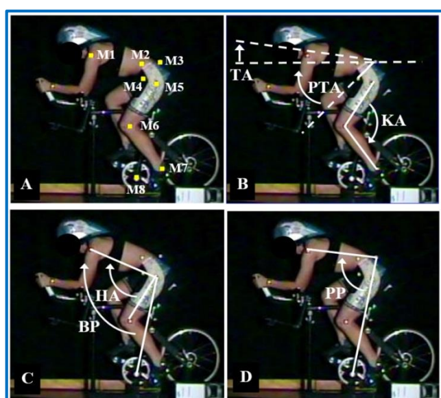
Figure 2. Illustration of kinematic variables assessed. A total of eight reflective markers (M1-M8 emphasized in yellow; A) were used to identify multiple body segments which were then used to define a collection of sagittal-view summary variables: Trunk angle (TA), pelvic tilt angle (PTA), and knee angle (B); hip angle (HA) and body position (BP) (C); pelvic position (PP) (D).

Once the ergometer was ready, the cyclist completed a 2-minute warm-up while pedaling 90 RPM and adopting the test position.