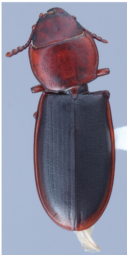
Fig. 3. Dorsal habitus of Tenebroides collaris collected from a Lindgren funnel trap baited with ETOH and alpha-pinene, 1 mi. south of Ridge Rd., Carter County, Montana, 8 June to 20 July 2012, by Ivie and Foley (MTEC).

This unmistakable species is easily recognized by its combination of a depressed body with orange-red head and pronotum, and relatively smooth, black elytra (Fig. 3). Prior to records presented here, the distribution of T. collaris was listed as “Eastern United States, Ontario, west to Michigan, eastern Texas” by Barron (1971). The furthest northwestern US record documented by Barron (1971) was Alpena, Alpena County, Michigan, in the far northeastern portion of that state, while the furthest southwestern record was from Grayburg, Hardin Co., Texas. In Montana, this species is now known to occur in 12 counties in the eastern half of the state (Fig. 2D) and is represented by 41 specimens, all but one collected by Lindgren funnels. Available label data indicate that some funnels were baited with either EtOH or a combination of EtOH and alpha-pinene. The earliest records are from 1990 from both Carter and Rosebud counties.