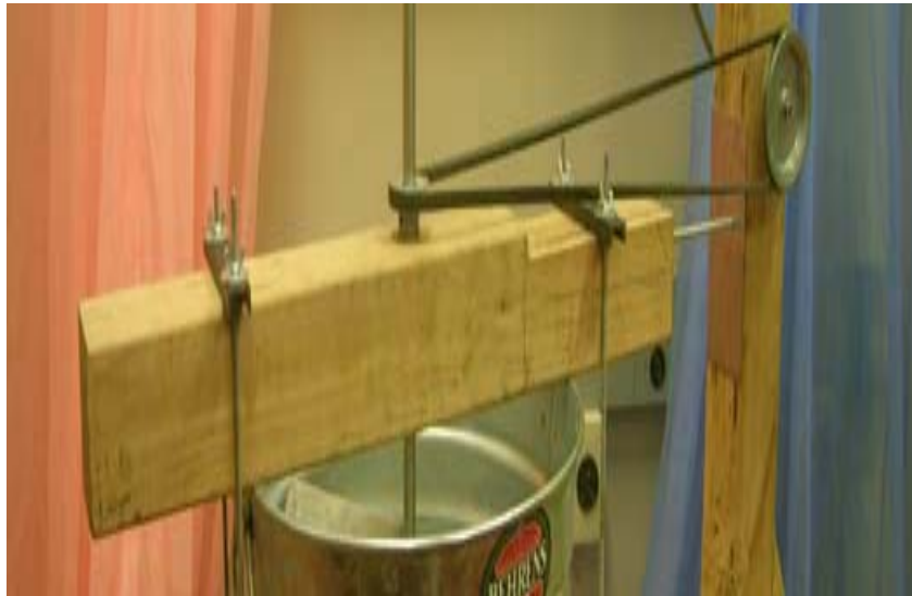
Figure 5. Manually Operated Churning Machine Developed by University of Saint Thomas

the local Malians would have adequate tools for constructing the machine. Cutting wood, drilling holes and alignment of parts were all done effortlessly by the local Malians. Welding would be completed by the local craftsmen. Working with the craftsman in Mali, it was evident that his capabilities and skills were exceptional for the work required to manufacture the blade assembly. Any failures or problems resulting from daily use of the machine would be easily maintained and fixed in Mali (UST, 2005).