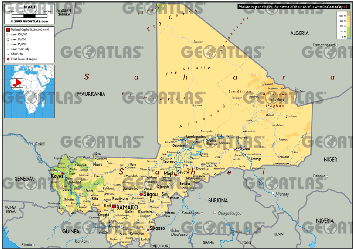
Figure 4: Map of Mali

all coordinated their efforts to support the development and promotion of Mali shea butter for a better economics revival at rural and national levels.