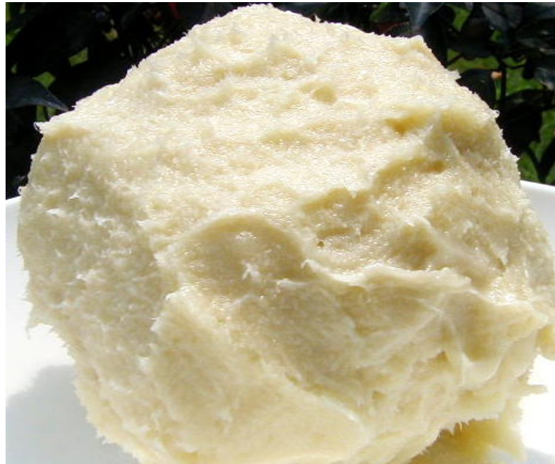
Figure 2 Shea Butter

The kernels are processed to obtain shea oil, which when solidified, formed a solid, fatty, butter-like substance called 'shea butter' (Figure 2)