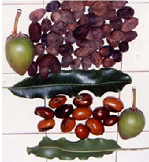
Figure1: Shea Fruits, Nuts, and Kernels

Shea kernels have substantial economic importance to some African countries as they consisted of 55 percent oil in weight (Casten and Synder, 1985). In general, the kernel fat content of Vitellaria is 20-50 percent. Fat content from 20-30 can be considered poor, whereas values in the mid 30's are intermediate and values above 40 percent are good. Value above 50 percent are rare and represent elite individual trees (Maranz and Wiesman , 2003). Shea butter is principally composed of five fatty acids: palmitic, stearic, oleic, linoleic and arachidic. In an extensive study of 42 shea populations in eleven African countries, Maranz and Wiesman , (2003) found stearic and oleic acids together accounted for 85 to 90% of the fatty acid in most samples. Maranz and Wiesman , (2003) also reported that the melting point of stearic acid was 69.9°C, while that of oleic was 16.3°C, and that the high stearic acid content of shea butter was responsible for the consistency that made this butter distinctive, while the relative