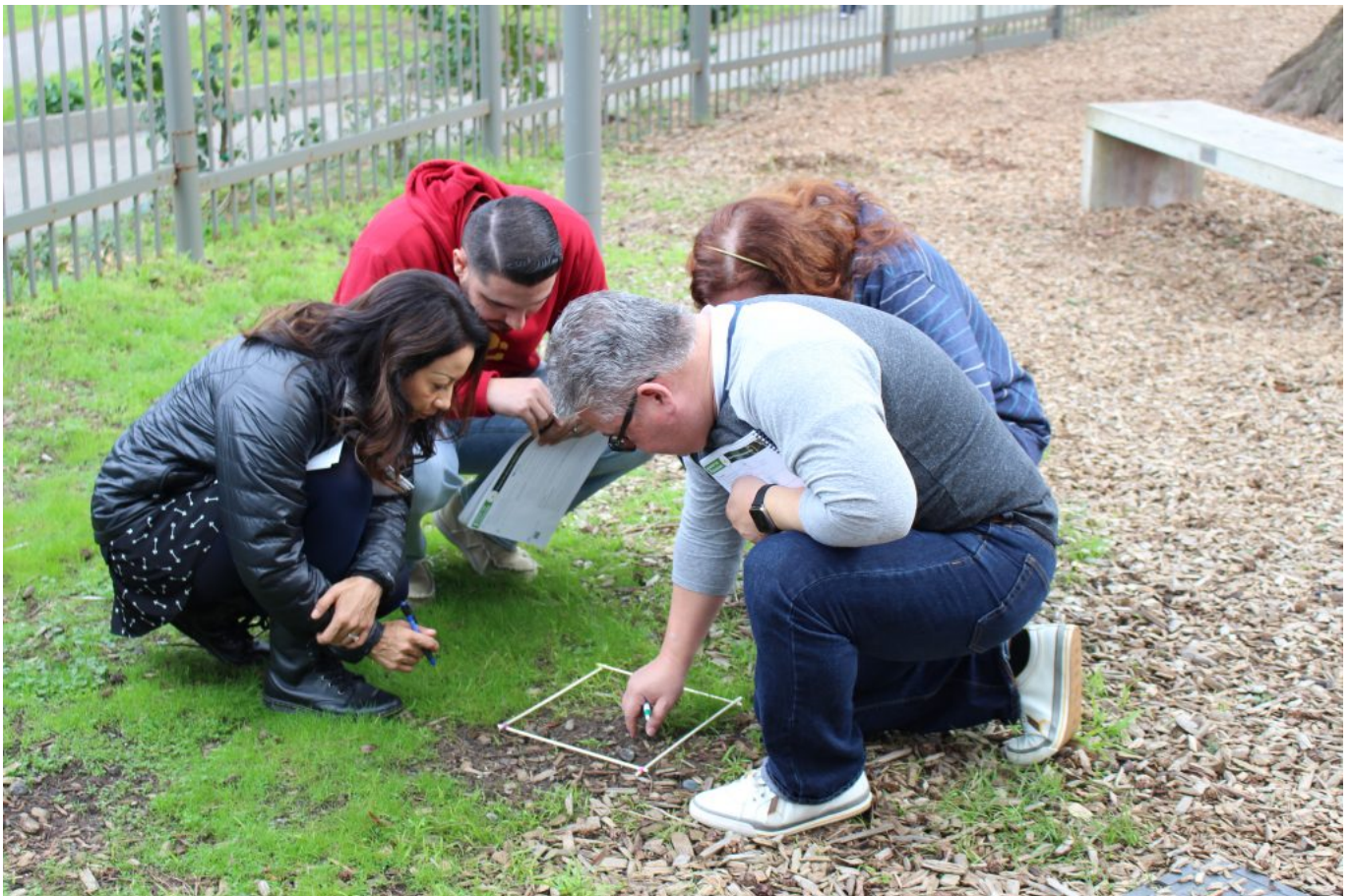
SAC Trainers use a quadrat to closely observe biodiversity.

The in-person workshop creates an environment in which new and returning participants can share knowledge, ask questions, and get hands-on practice with SAC activities in a supportive and nurturing environment. In both the ToT and Activity Leader Training (ALT), educators learn which STEM concepts to emphasize with youth, which science practices to highlight, and how to address common challenges that activity leaders may present, such as lack of confidence with science or fear of nature. They trade examples of successes achieved and lessons learned, practice giving constructive feedback, and role-play common scenarios from the youth and activity leader perspectives. In addition, activity leaders practice facilitating and conducting SAC activities and citizen science experiences, such as submitting bird count checklists to eBird , or submitting arthropod observations to iNaturalist for identification.