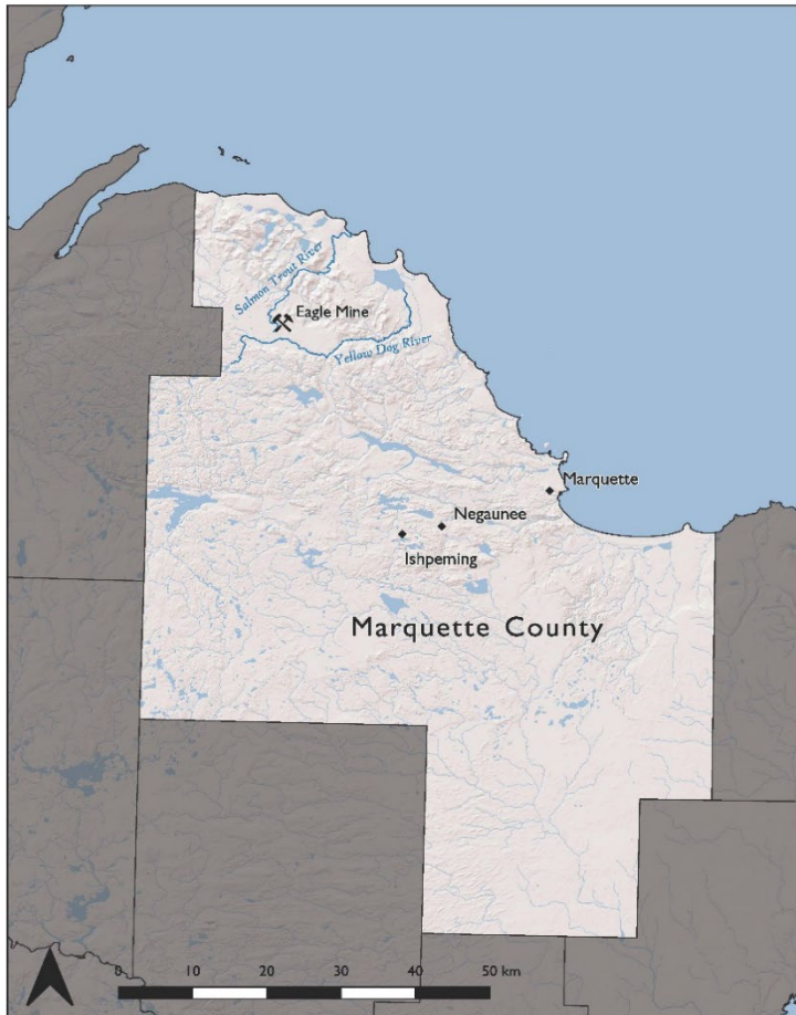
Figure 1. Map of Marquette County, MI, including the Eagle Mine, nearby communities, and rivers potentially affected by mining operations. Data sources: (1) State of Michigan GIS Clearinghouse (2) ESRI.

County financial statements for fiscal year 2019 show that the total county budget is $58,881,711, or $879 per capita, and intergovernmental revenue is $2,775,875 (County of Marquette, Michigan, 2019).