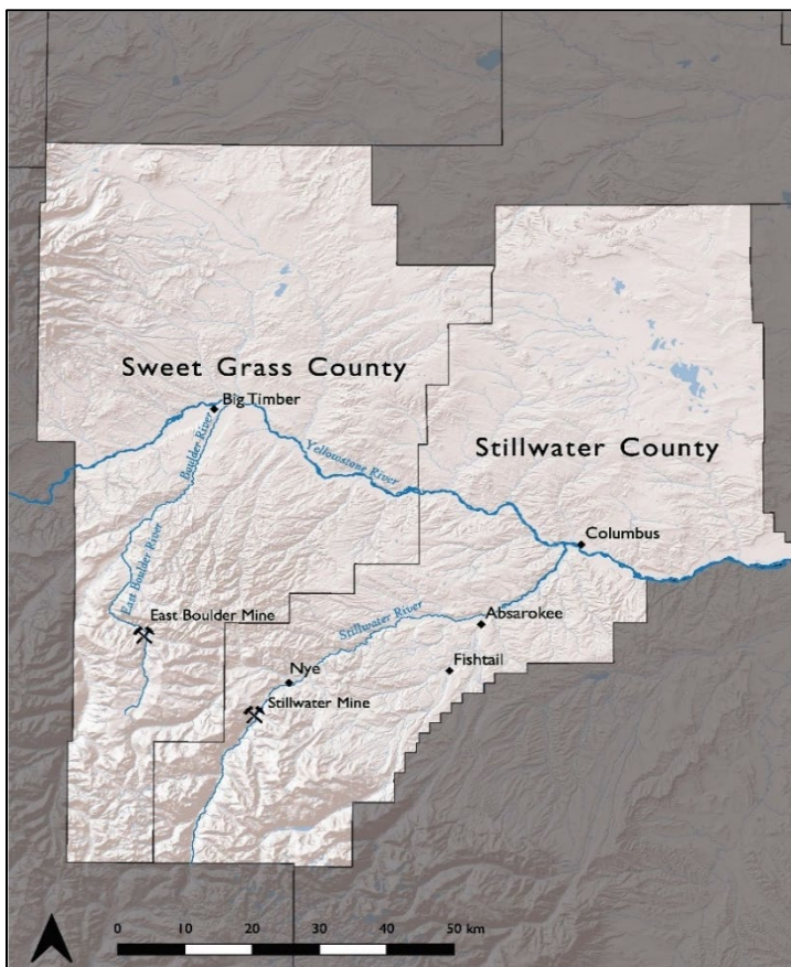
Figure 2. Map of Stillwater County and Sweet Grass County, MT, including the Stillwater Mine, East Boulder Mine, nearby rural communities, and rivers potentially affected by mining operations. Data sources: (1) Montana State Library (2) ESRI

timeframe (Bureau of Economic Analysis, 2019). In 2018, Stillwater County had an unemployment rate of 3.3%, while Sweet Grass County reported an unemployment rate of 3.0% (Bureau of Labor Statistics, 2019). County financial statements for fiscal year 2019 state that the total county budget in Stillwater County is $12,888,116, or $3,483 per capita, and intergovernmental revenue is $6,609,970. In Sweet Grass County, the total budget is $6,245,217 and intergovernmental revenues equal $2,154,579. Each county also has a trust account as established by the Montana Hard-Rock Mining Impact Act. The trust account for Stillwater County has $12,797,236; in Sweet Grass County the trust