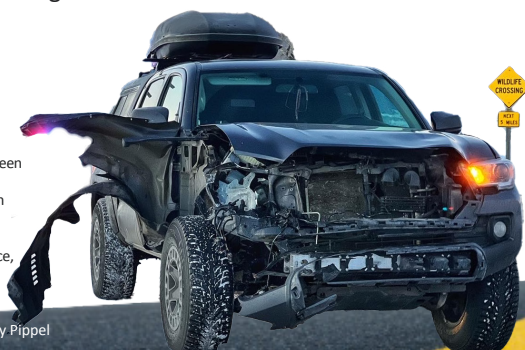
Photo of vehicle

Get more information and view the full report: