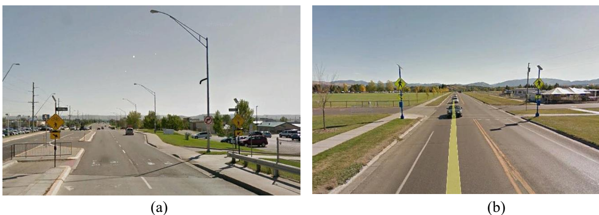
Figure 2: Street view of the two study sites a) King Avenue eastbound, b) Kagy Boulevard

Figure 2 shows images of the two sites extracted from Google Earth street view shots.