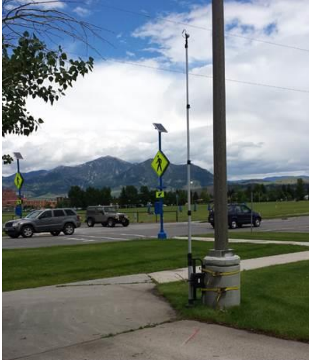
FIGURE 1 Video data collection equipment attached to a utility mast.

The video cameras were relatively small in size and remained largely invisible to drivers and crosswalk users. Figure 1 shows the video data collection equipment deployed in the field.