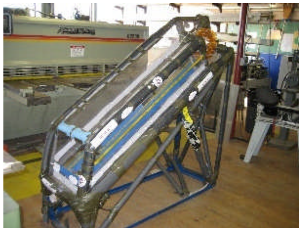
Table that is going to the ISS made by HUNCH students