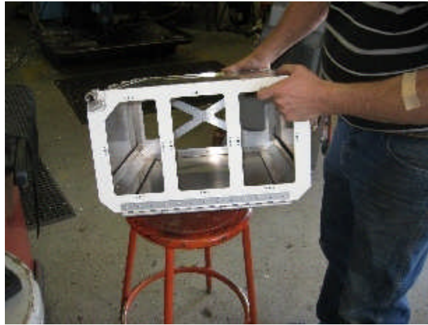
ISS Single Stowage Locker made by HUNCH students