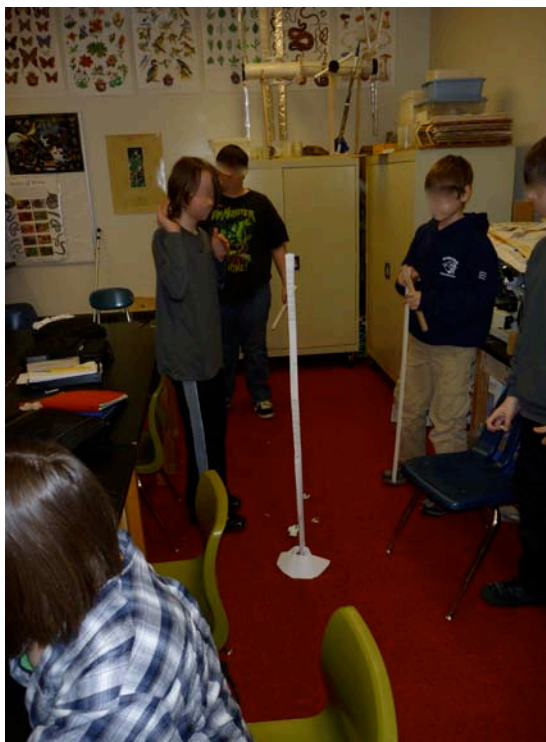
Figure 2. Paper Tower Activity.

When presented with the materials for this activity, I asked students the question: what materials do we have to make a paper tower? Then I asked the students to think about ways they could change or alter the materials they had to help them build a paper tower, and, as a group, decide the ways they would alter their materials. The groups came up with various ways they could fold, cut, tear, crimp and connect the paper, as well as universally deciding that one foot-long piece of tape was less desirable than numerous smaller pieces. Finally, the groups tested their ideas and measured the results of altering their materials. This was a fun and engaging way to employ the steps of the Four Question Strategy, and to see that the approach could be effective and useful.