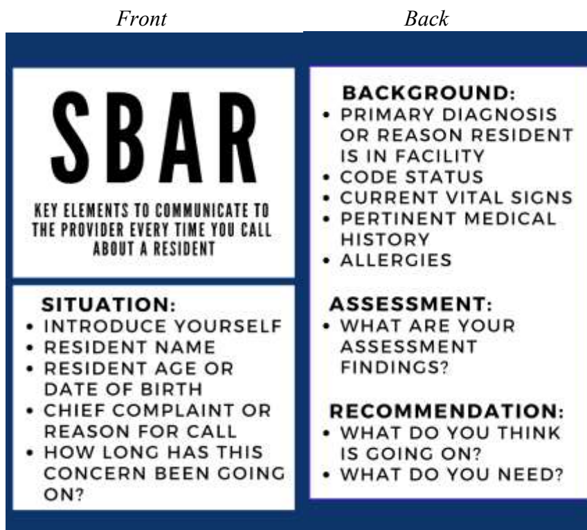
Figure 2. SBAR Badge Card.

A single training was held in the afternoon, with snacks and coffee supplied to staff. Management and geriatric providers at the facility then reinforced the training over the following week and educated nurses who did not attend. The facility management staff was left with the