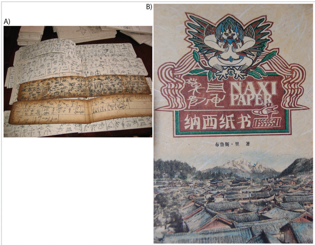
FIGURE 2 (A) Traditional Dongba papermaking. (B) Commercial Dongba papermaking.

that produce paper in the community, all interviewed households have knowledge of the habitats, types, traditional processing, and use of W. delavayi resources. Other than for papermaking, informants in Kenbeigu manage W. delavayi resources in their land use schemes for medicine and as a natural pesticide that grows in their home gardens and fields.