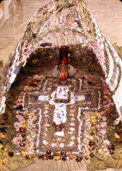
Informational text or label at the bottom of the image, partially obscured.